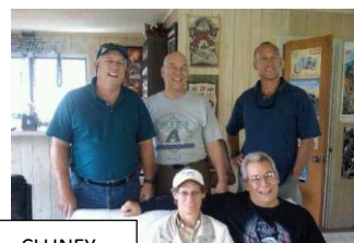
CLUNEY KIDS REUNION